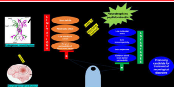
Fig: This illustration highlights that neurotrophin peptidomimetics address key limitations of endogenous neurotrophins, offering enhanced stability, improved brain permeability, and lower immunogenicity, making them promising candidates for treating neurodegenerative diseases.

One of the significant advantages of peptidomimetics is their improved stability and bioavailability compared to endogenous neurotrophins. This means they can be delivered more